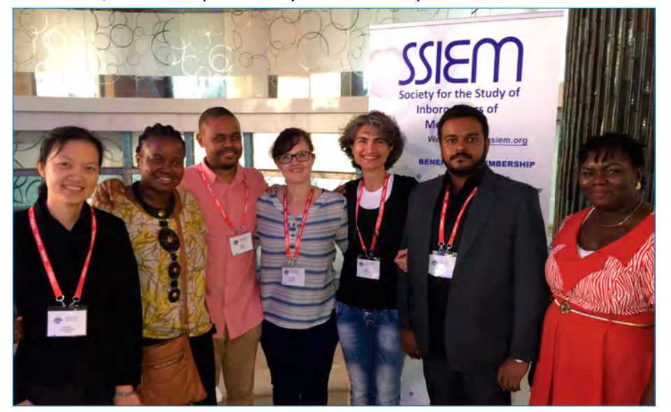
SSIEM scholarship recipients network during the Paediatric Congress

Financial support for the Congress, a satellite meeting presented in advance of the IFCC WorldLab on a triennial basis, was independently recruited by the TF-PLM Committee members. The efforts once again re-