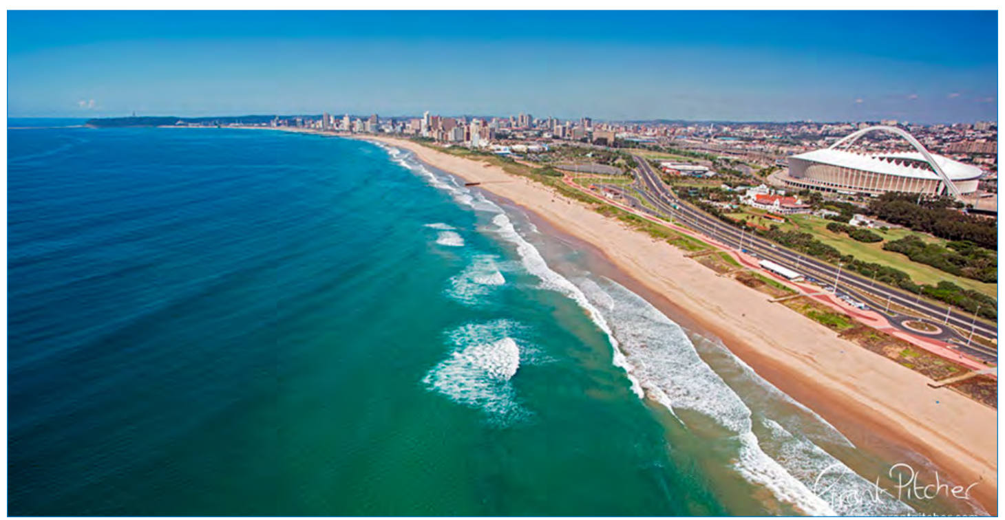
Aerial view of the Durban, South Africa coastline