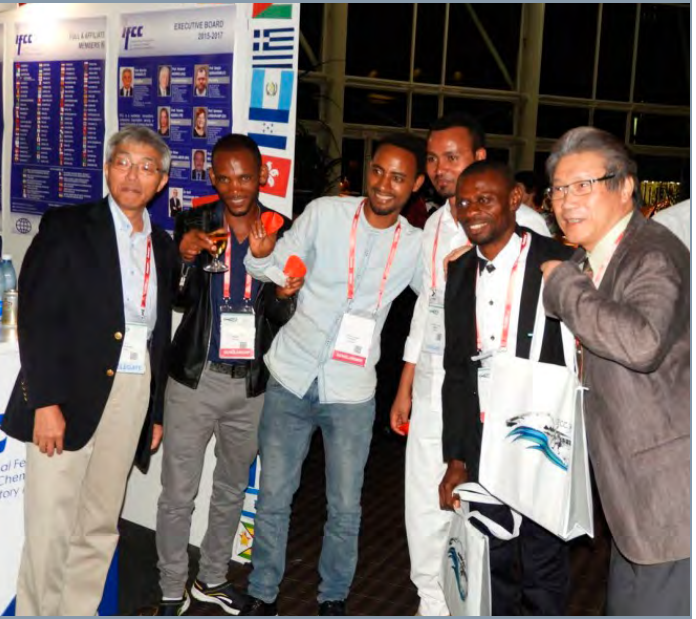
Delegates at the opening ceremony cocktail function