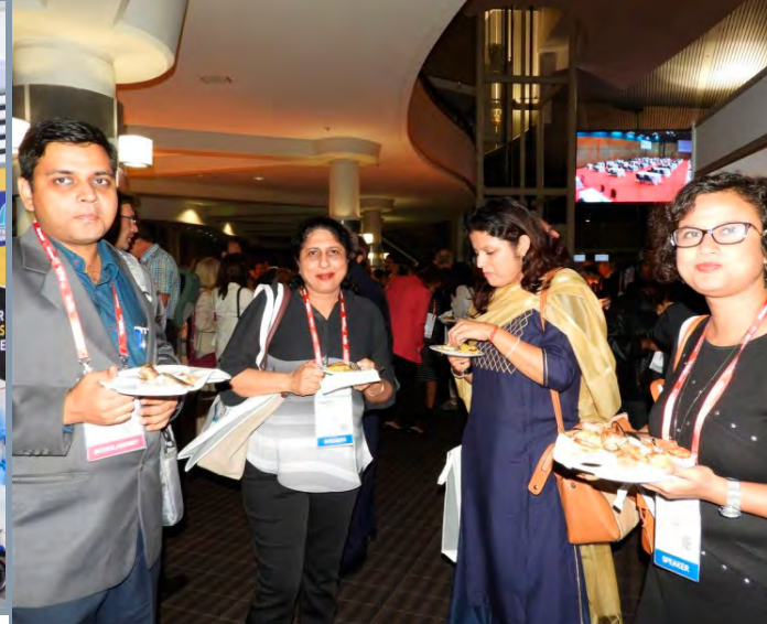
Delegates at the opening ceremony cocktail function