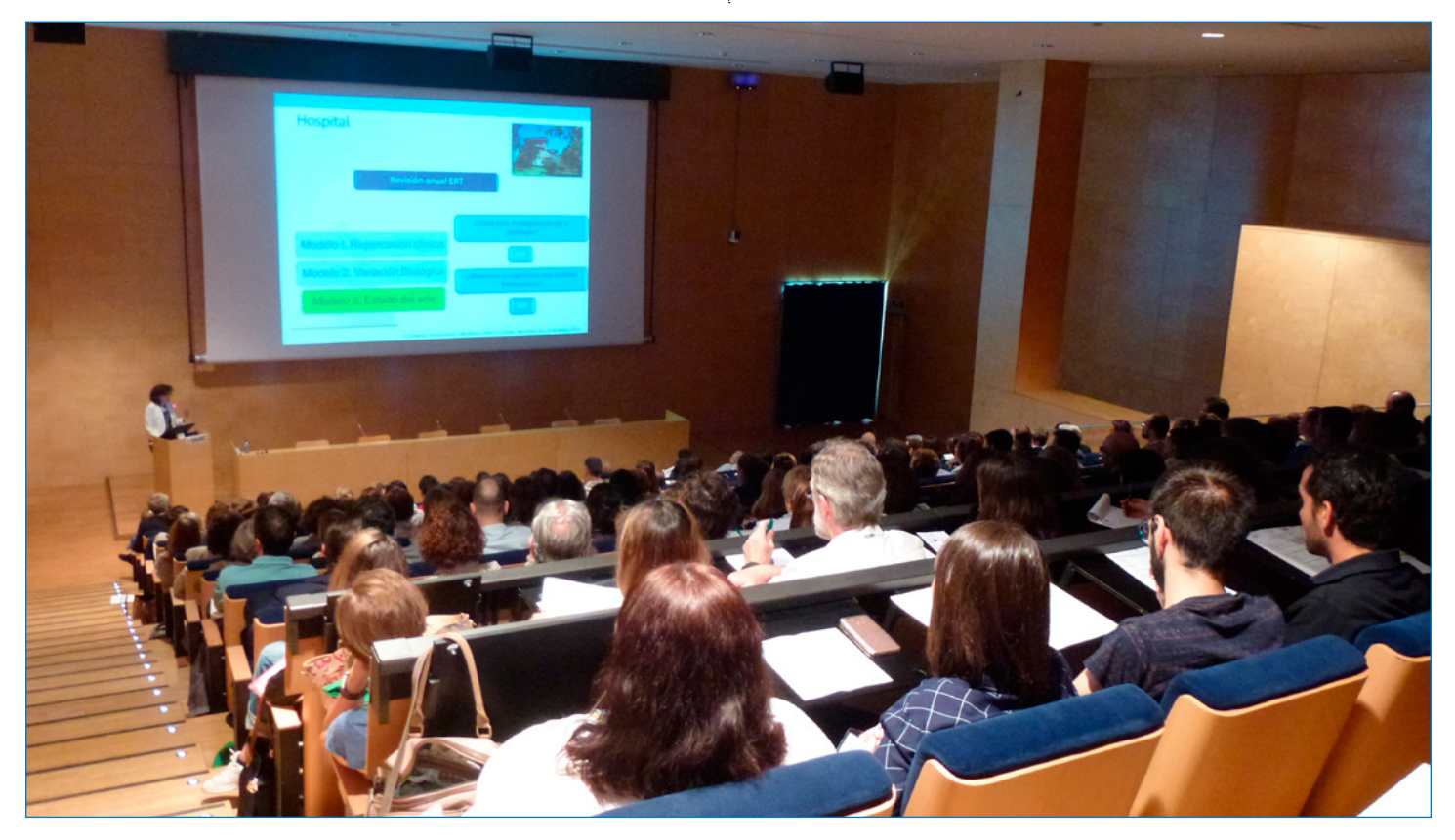
Audience at the Symposium

"To maintain a quality standard in genetic studies, these must be done in reference centres that participate in the External Quality Assurance Programs that exist specifically for each disease", concluded the president of the SEQC<sup>ML</sup> Committee on External Quality Assurance Programs.