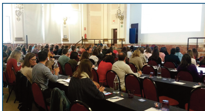
Snapshots of different courses during the SEQCML Scientific Committee Conferences