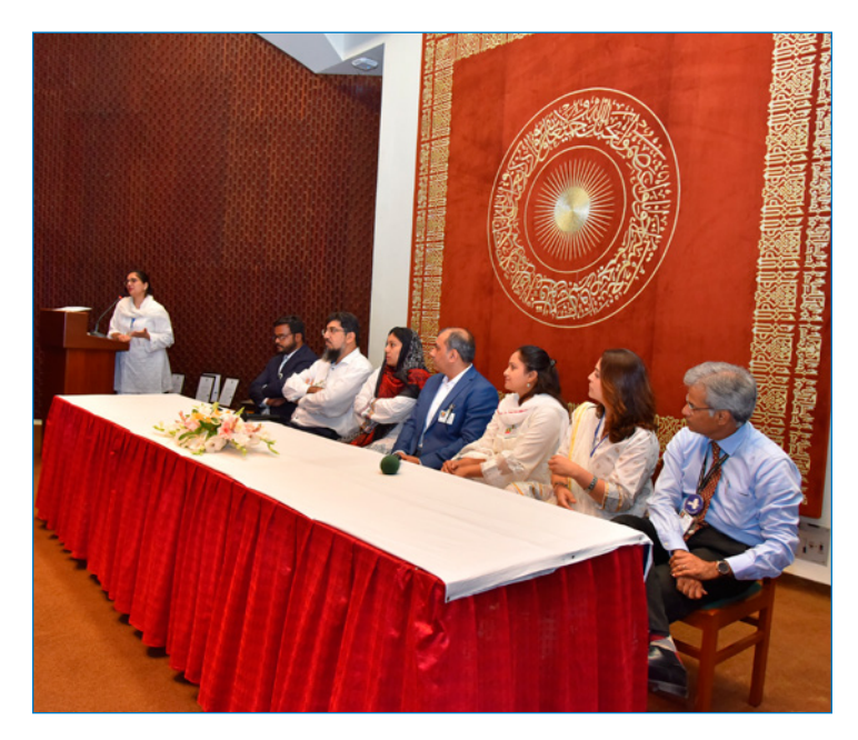
Group photo of presenters and panelist

of a healthy and an osteoporotic bone and the best poster was awarded at the end of the programme.