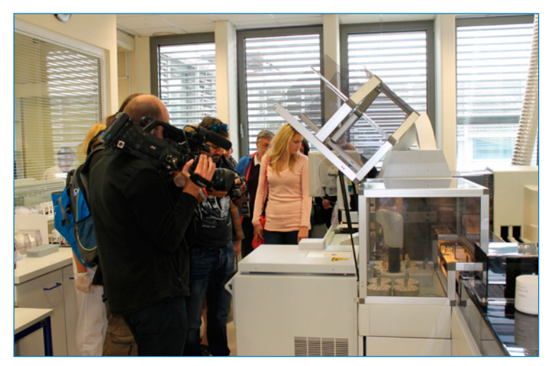
Visiting laboratories and looking at /recognizing the laboratories from different perspectives

On this occasion, we have also issued a common notice about the event in the form of a poster and the brochure that represents our profession and is from now on available for the patients and visitors in all clinical chemistry laboratories in Slovenia. These activities were extensively promoted in different media (TV broadcasts and news programs, newspapers, radio), at the national level and on local levels as well.